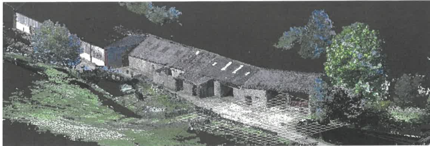
1 East Elevation Existing 1 : 100