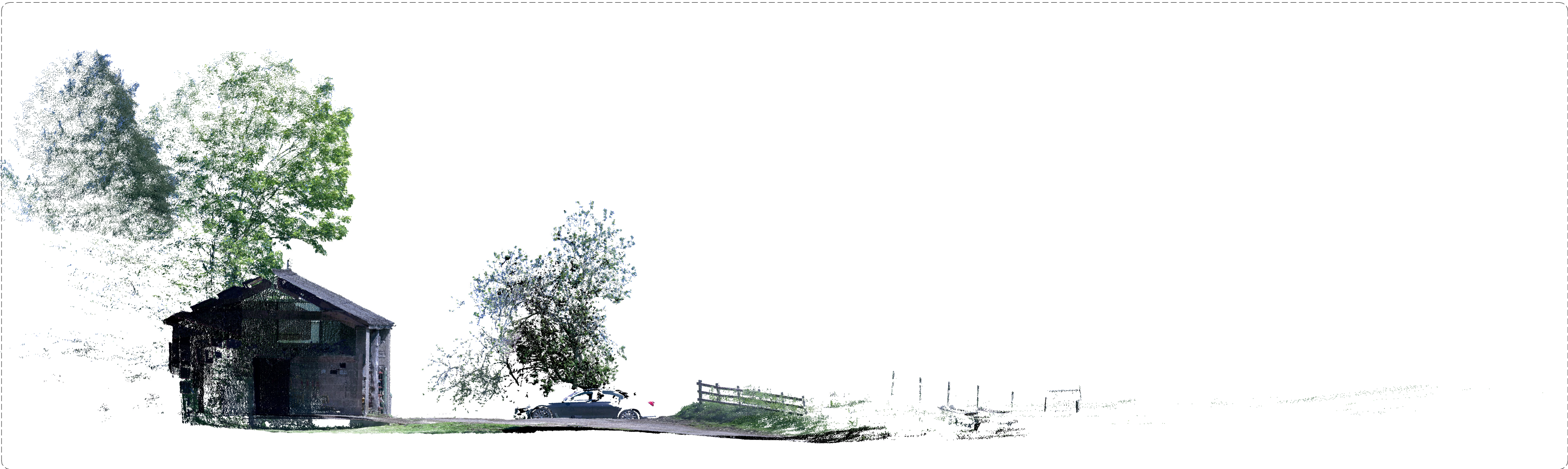
3 Section 10 1 : 100